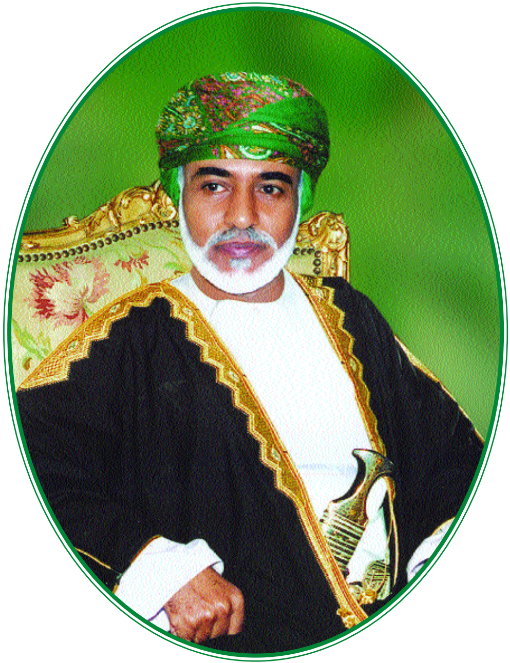
His Majesty Sultan Qaboos Bin Said